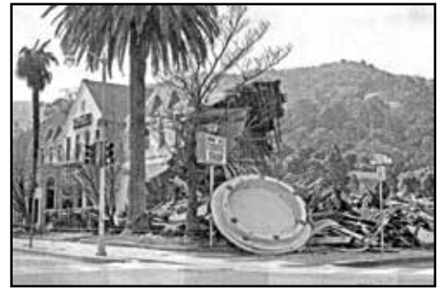
Demolition of Hotel Lyndon, 1963

This first-class hotel eventually fell into ruins and was demolished in 1963. In its place, the Lyndon Plaza office building was constructed. Today you can sit at Willow Street Pizza or Main Street Burgers enjoying