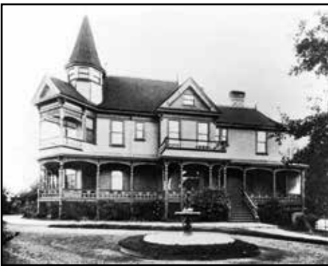
Lyndon Heights, circa 1886